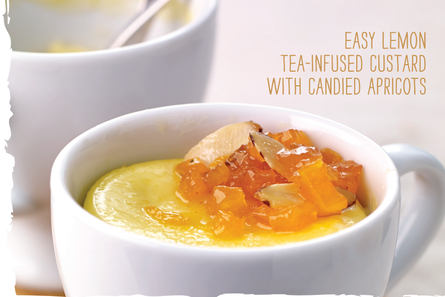
EASY LEMON TEA-INFUSED CUSTARD WITH CANDIED APRICOTS