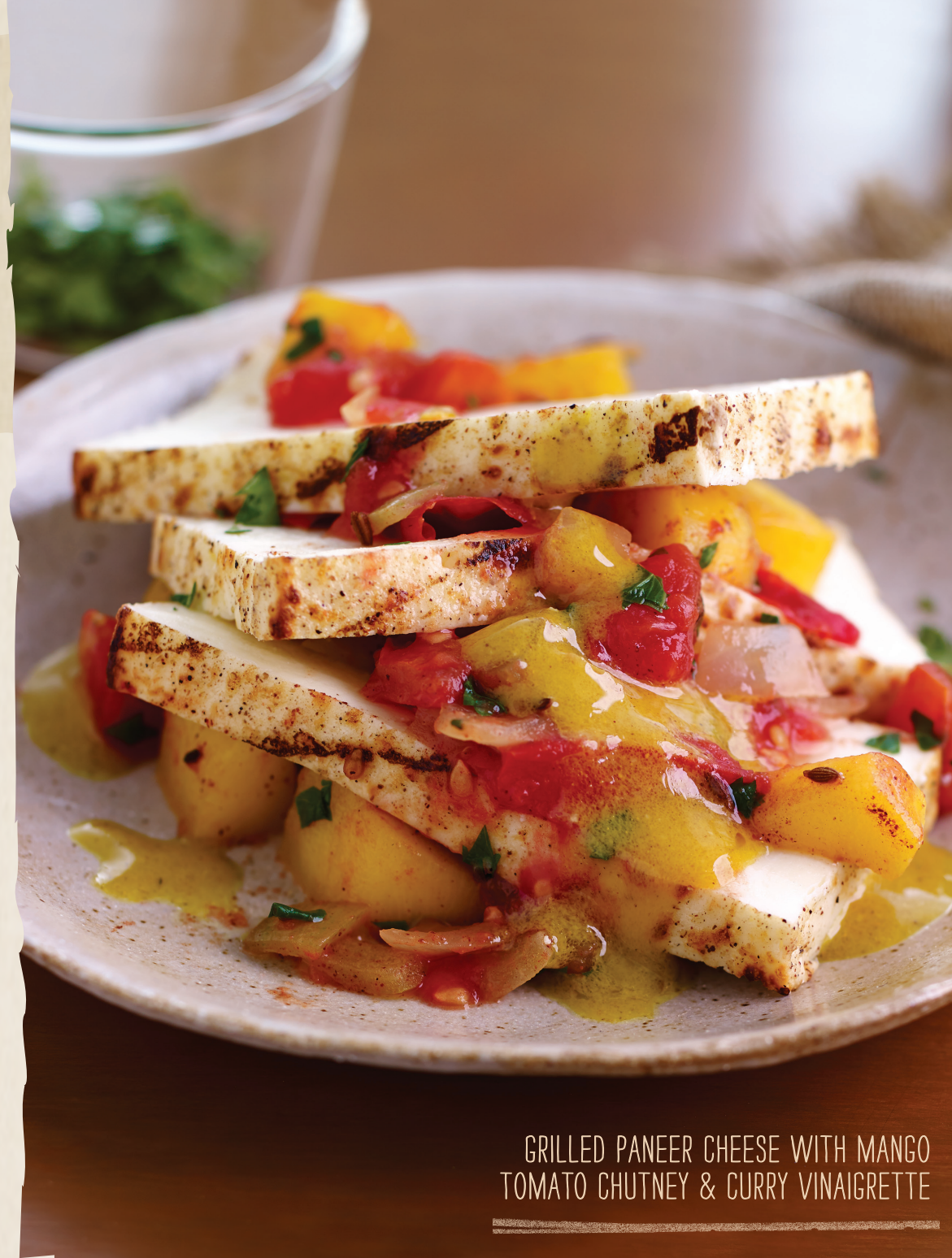
GRILLED PANEER CHEESE WITH MANGO TOMATO CHUTNEY & CURRY VINAIGRETTE