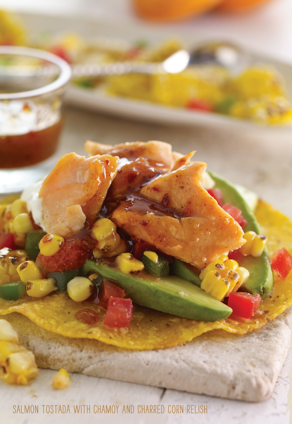
SALMON TOSTADA WITH CHAMOY AND CHARRED CORN RELISH