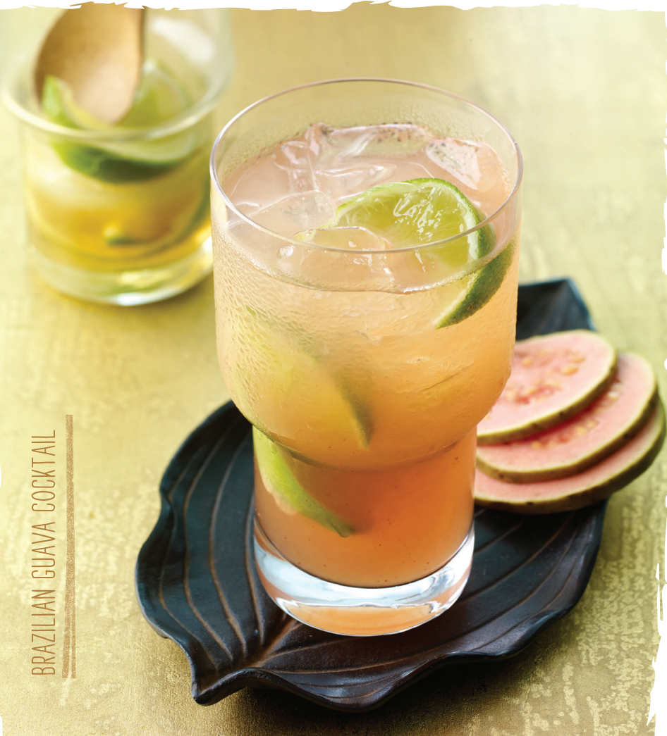
BRAZILIAN GUAVA COCKTAIL