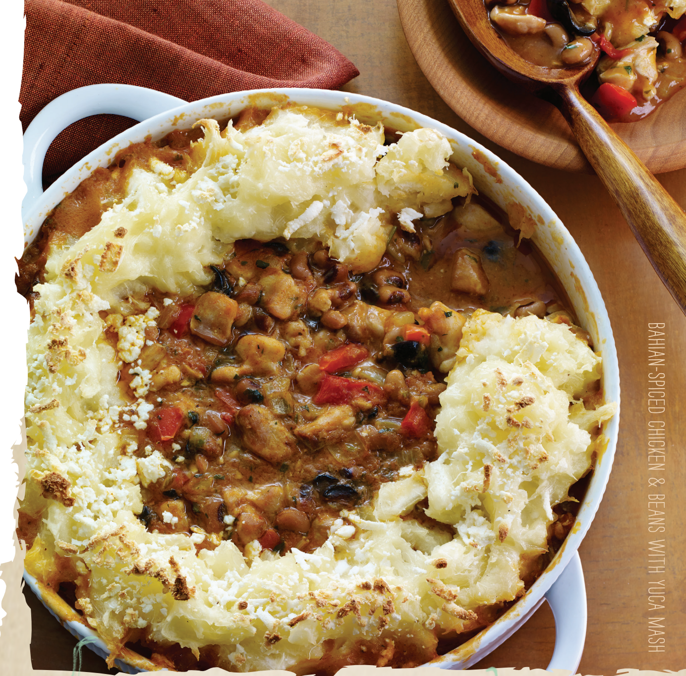
BAHIAN-SPICED CHICKEN & BEANS WITH YUCA MASH

TEMPERO BAIANO BAHIAN SEASONING BLEND CONTAINING OREGANO, PARSLEY, VARIETIES OF PEPPER AND CUMIN