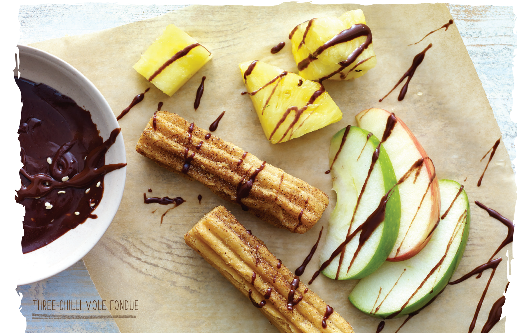
THREE-CHILLI MOLE FONDUE

These insights reflect emerging trends and key cultural influences that are shaping the tastes of tomorrow. Together, they tell an exciting story about how people everywhere are coming together for more diverse, colourful and flavourful meals than ever before.