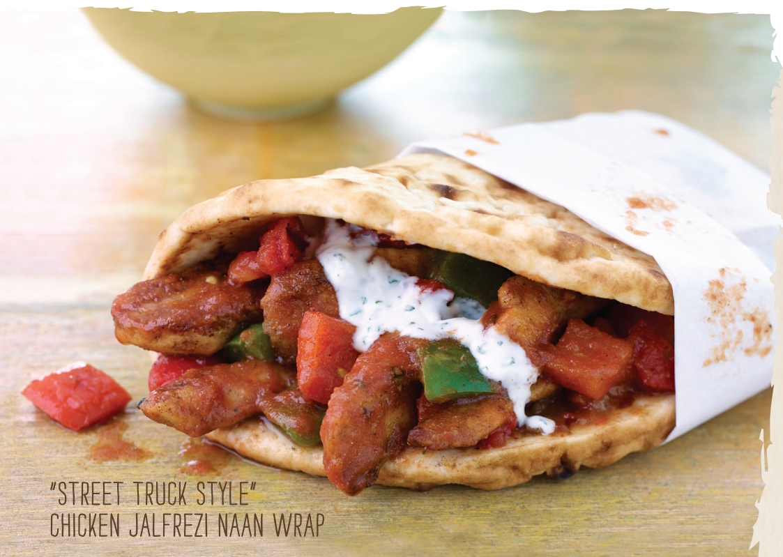
"STREET TRUCK STYLE" CHICKEN JALFREZI NAAN WRAP