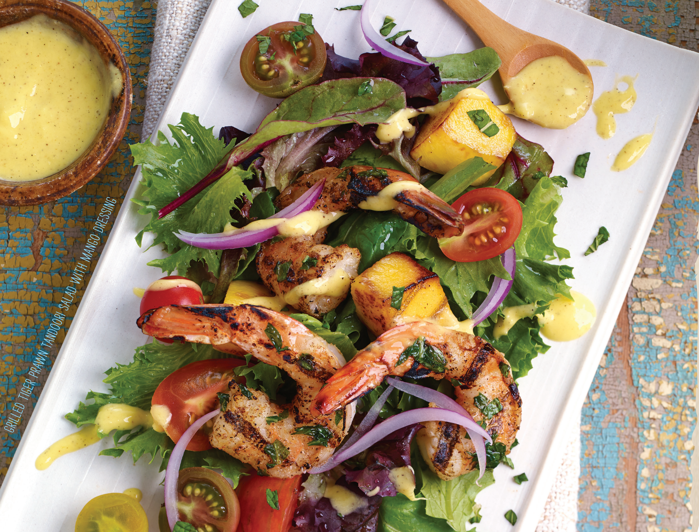
GRILLED TIGER PRAWN TANDOORI SALAD WITH MANGO DRESSING