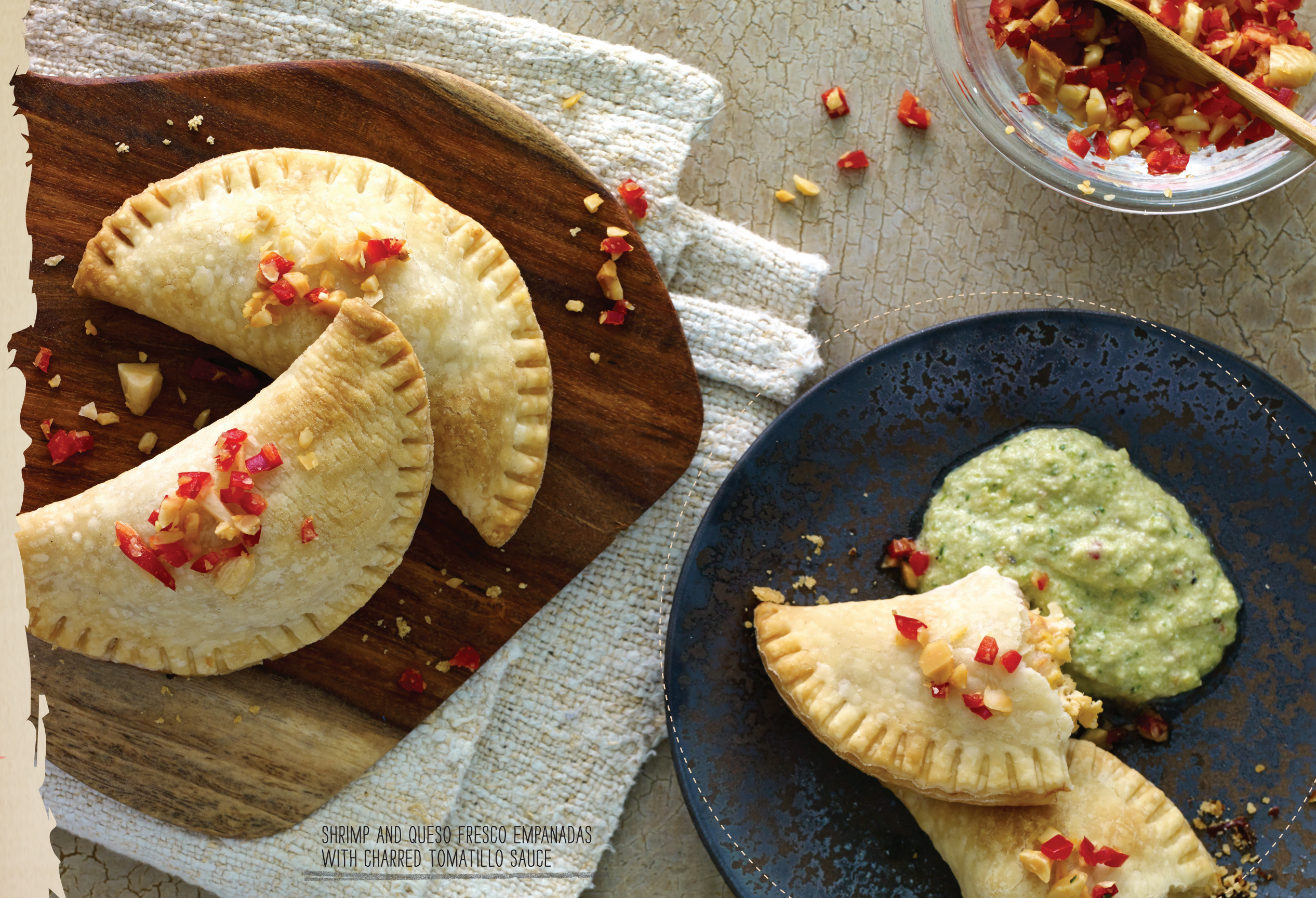
SHRIMP AND QUESO FRESCO EMPANADAS WITH CHARRED TOMATILLO SAUCE