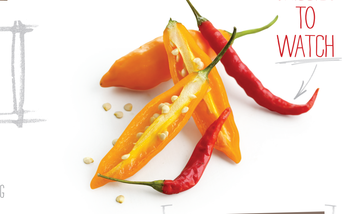
TIEN TSIN HOT SZECHUAN CHILLI AJI AMARILLO HOT PERUVIAN YELLOW CHILLI