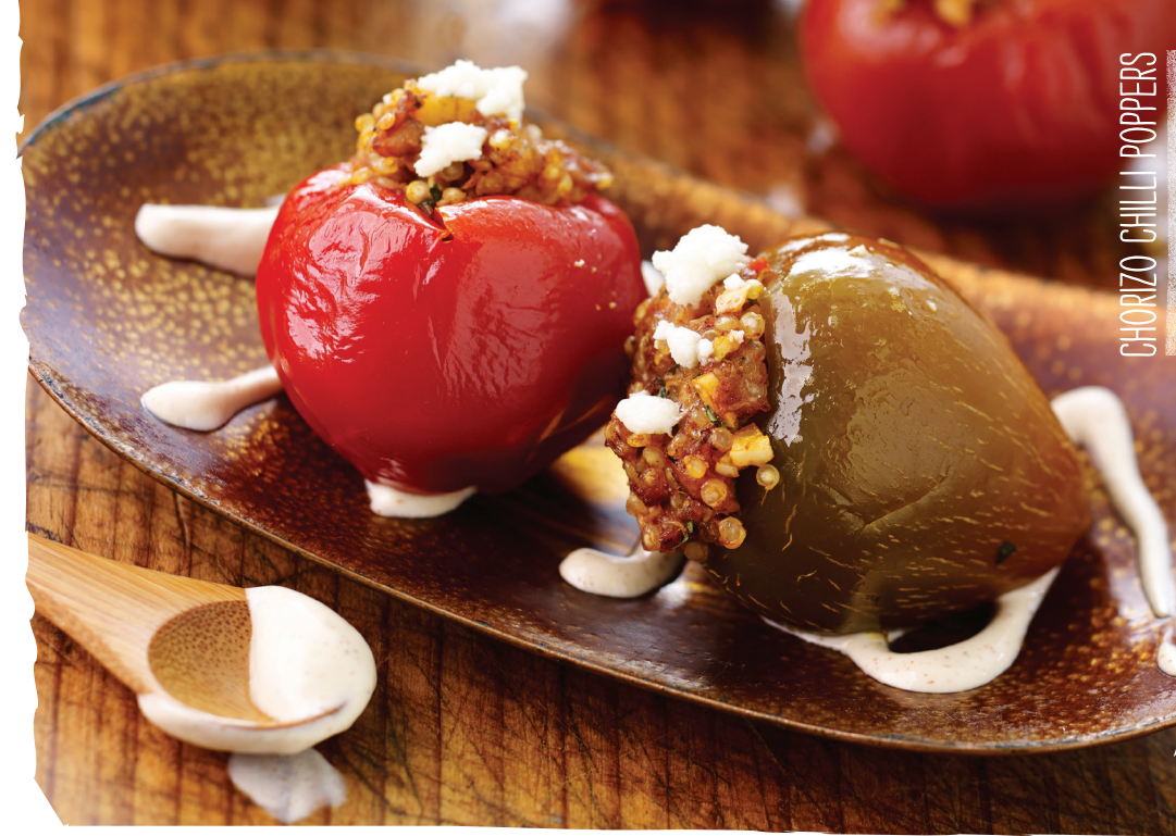
CHORIZO CHILLI POPPERS

“In Szechuan province, people eat chillies in nearly every meal, whether at street kiosks or high-end restaurants. Chillies are everywhere!” —Chef Billy Mi, China