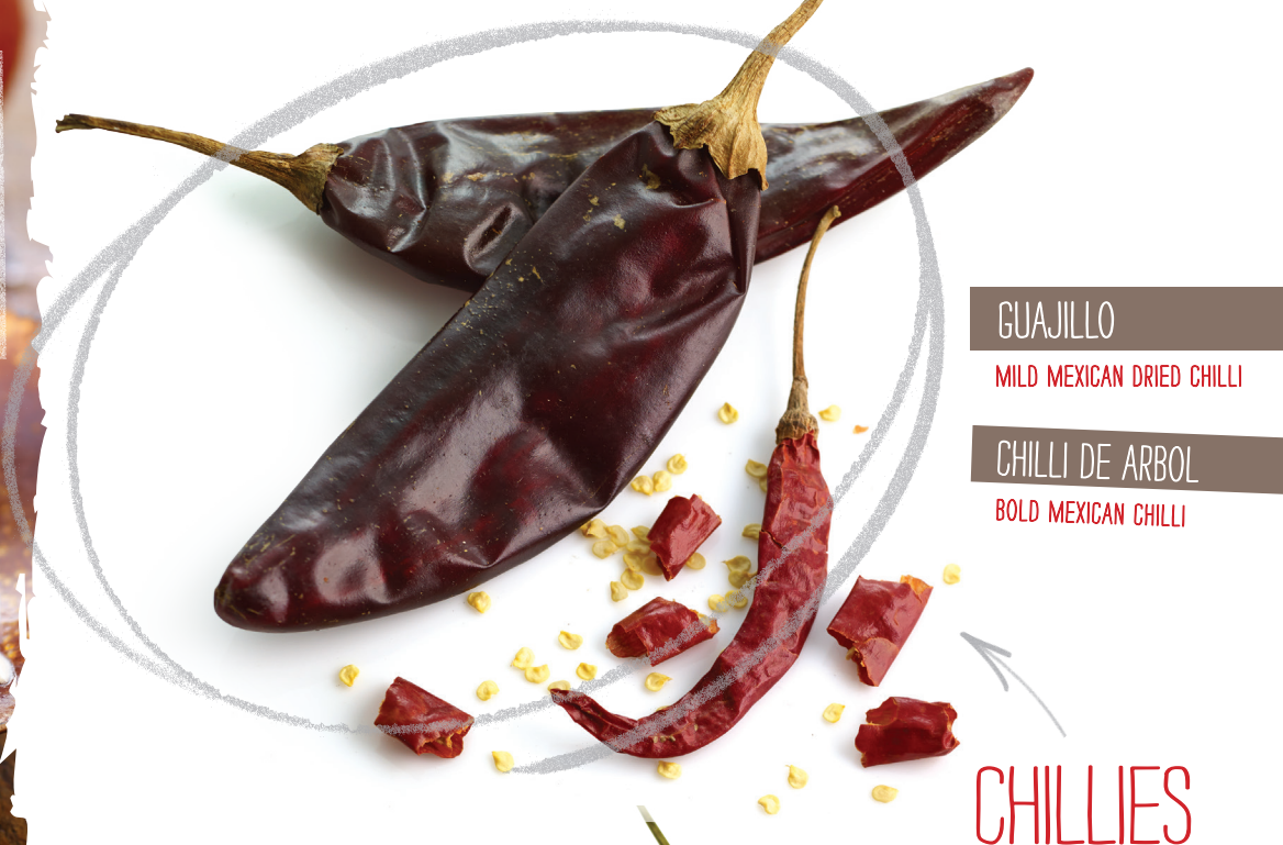
GUAJILLO MILD MEXICAN DRIED CHILLI CHILLI DE ARBOL BOLD MEXICAN CHILLI